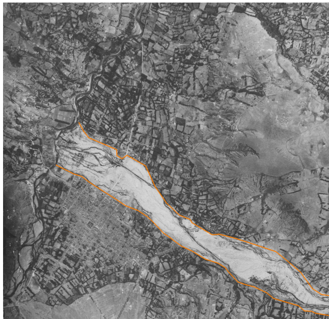
Fig. 4. An aerial photograph of the destroyed city of Huaraz following the aluvión from Lake Palcacocha. The area affected is defined by the orange line; the photograph was taken in 1948, seven years after the flood.

icefall into the lake producing displacement waves (45 %) while the second has been landslides or rockfalls into the lake (35 %) (Emmer and Cochachin, 2013). Furthermore, in this area, another important trigger is earthquakes as these may initiate mass movements or cause changes to the internal structure of a moraine dam leading to piping and ultimately dam failure. There have also been instances in which an upstream flood wave has propagated downstream and then caused a GLOF (Vilímek et al., 2005b). This mountain range hosts a number of lakes whose dams have been stabilised by a range of remedial work (Reynolds, 2003; Carey, 2005) (Figs. 5 and 6), and such remediation also has to be considered during the hazard assessment.