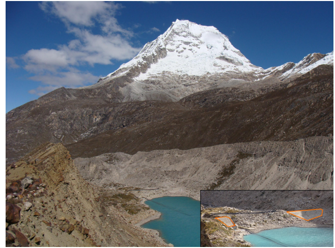
Fig. 6. Lake Palcacocha and its steep lateral moraines, which are predisposed to slope movements, in July 2012. The inset shows the two artificial dams (highlighted in orange) and siphons (black pipes within the lake) constructed during autumn 2011; the dam freeboard is about 9 m.

It may be that a flood wave generated from an upstream lake leads to an outburst flood from a downstream lake even if its dam is considered to be stable and there are no obvious direct triggers (e.g. there is no possibility of