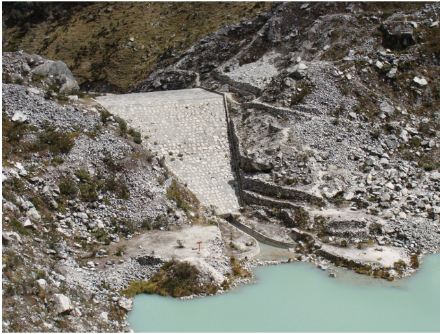
Fig. 5. The artificial dam and armoured outflow of Lake Llaca; the dam freeboard is 12 m.

of the glacier snout. The second group includes landslides, rockfalls, and various types of flows. The most important factors for these movements are thought to be the slope of the internal face of a lateral moraine and the presence of rocks predisposed to rockfalls directly above the lake.