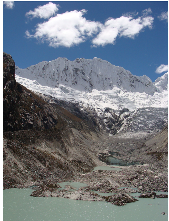
Fig. 3. The growing Lake Llaca with its retreating glacier and protruding basal moraine.

It is known that GLOFs have been generated from some of these lakes. The most catastrophic occurred on 13 December 1941 when an aluvión occurred as a result of two moraine ruptures at lakes Palcacocha and Jircacocha. It destroyed one-third of the city of Huaraz (Fig. 4) and claimed about 6000 lives (Lliboutry et al., 1977). This event resulted in a number of glacial lake stability studies that investigated the possibility of further outburst floods in the Cordillera Blanca. Such flooding still occurs despite a range of remedial work that has stabilised more than 30 dams (Reynolds, 2003; Carey, 2005). The three most recent events to have caused damage occurred on 19 May 2003 at Lake Palcacocha in the Cojup Valley (Vilímek et al., 2005b), on 11 April 2010 at lake no. 513 in the Hualcán Valley (Carey et al., 2011), and on the 8 February 2012 at lake Artizon Bajo in the Santa Cruz Valley (A. Cochachin, personal communication, 2012).