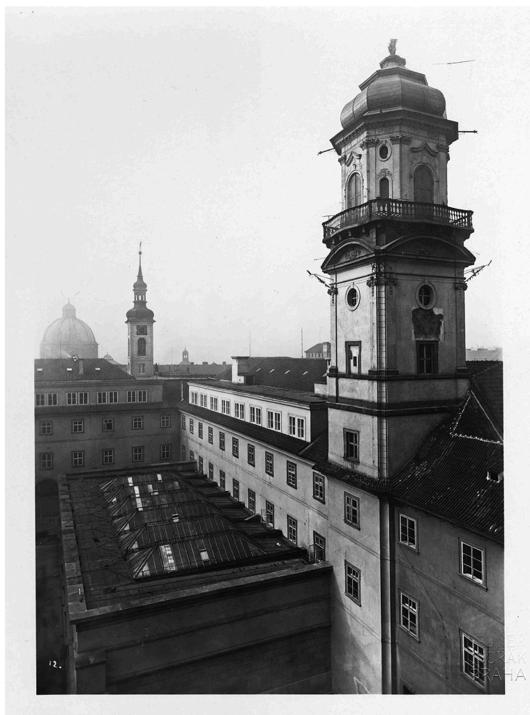
Fig. 1 Clementinum astronomic tower in the 1930's.