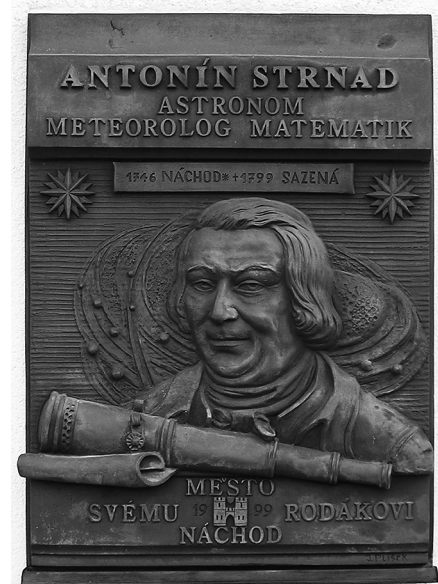
Fig. 4 Commemorative plaque of Professor Antonín Strnad by sculptor J. Plíšek in Náchod.

Antonín Strnad was busy with popularization of science and since 1789 cooperated with the Patriotic Economic Society (Seydl 1947). His handbook Physikalisches Taschenbuch auf das Jahr 1789 für Freunde der Ökonomie und Witterungskunde was intended for farmers. Since